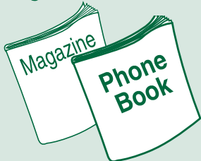
Magazines & Phone Books