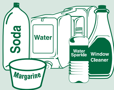
Plastics #1-7 containers