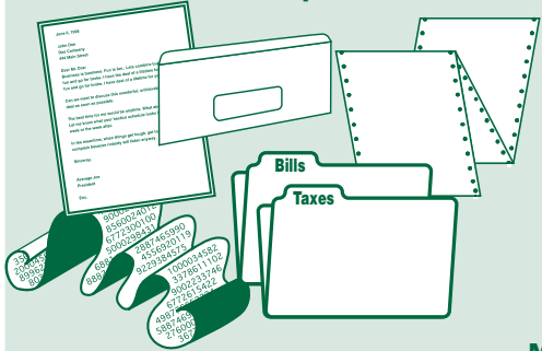
Office Paper & Junk Mail