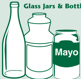
Glass Jars & Bottles